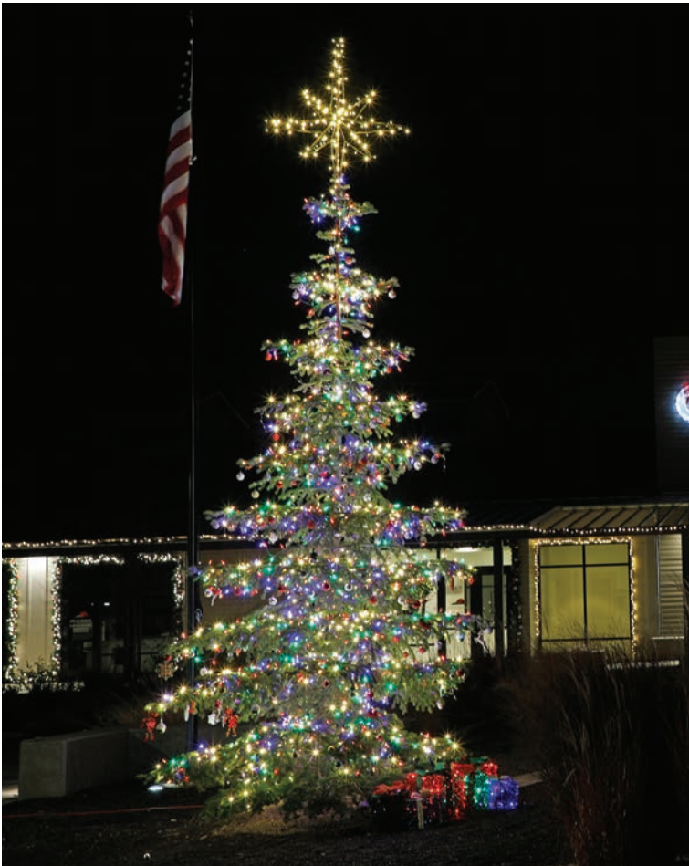
Lights for Life Tree, Phoenix