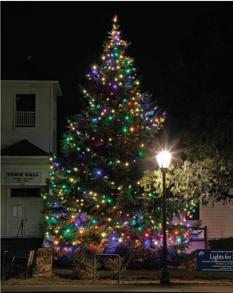
Lights for Life Tree, Talent