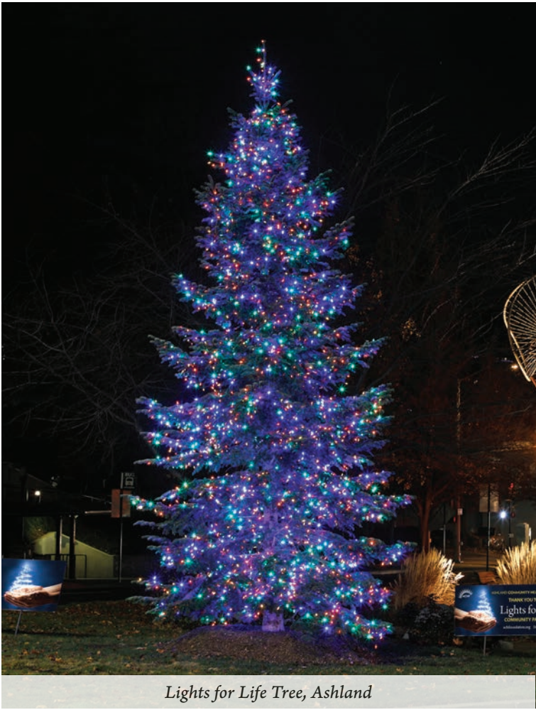
Lights for Life Tree, Ashland