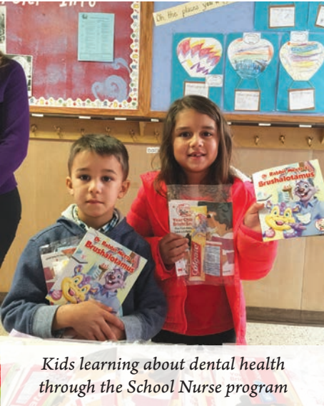
Kids learning about dental health through the School Nurse program

The AACH Laboratory Department was awarded $19,957 to purchase two refrigerators and a freezer to maintain specimen integrity and to support lab staff appreciation week. The hospital’s Engineering Department received $16,060 to support facility-wide painting in all common areas and patient rooms, which will accelerate the implementation of the age-friendly care model at AACH. The lab and engineering grants were made possible through a generous planned gift from The Allen A. Alsing & Katherine M. Alsing Fund of the Oregon Community Foundation.